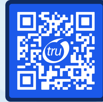
CLOC Global Institute 2024