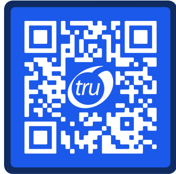
2024 eDiscovery Jobs Report