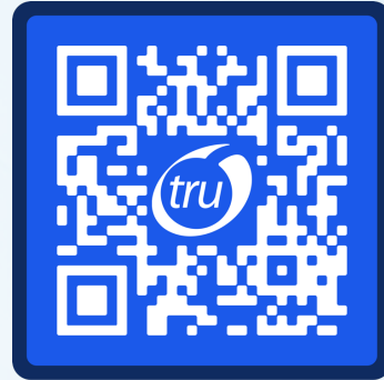
2024 Data Privacy Jobs Report